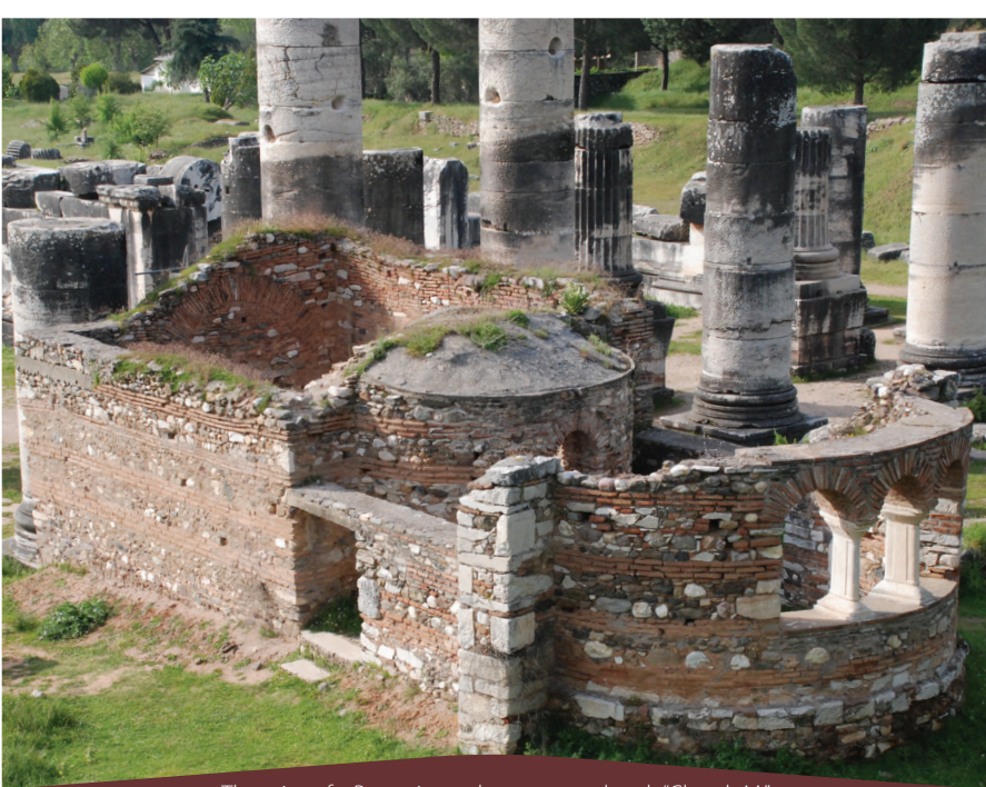
The ruins of a Byzantine style mortuary church "Church M," discovered in 1910 during the excavation of the Temple of Artemis.

The patron goddess of Sardis was Cybele, the nature goddess associated with the moon. She was also believed to be able to bring back to life the