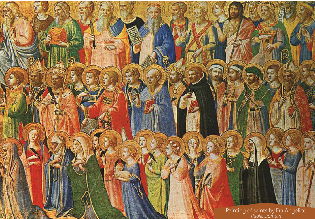
Painting of saints by Fra Angelico

innocence. That life inevitably has produced a harvest of losses and consequent sadness. It is only as we are absorbed fully into the very Body of Christ that we are fulfilled as human beings and can become what we were meant by God to be. It is then that our tears are wiped away. We have gained forever what can no longer be lost. Today, while still on the rocky road of earthly, sinful life, losses come to us in all forms. The message of All Saints Day is that, by the grace of God, we can endure and transcend the losses, to reach the eighth day, the day without loss. “He who overcomes will thus be clothed in white garments and I will not erase his name from the book of life” (Rev. 3:5).