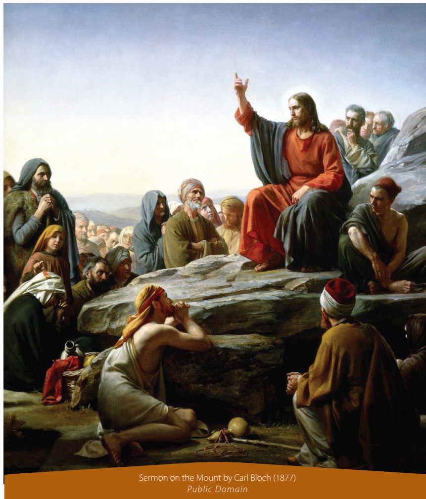
Sermon on the Mount by Carl Bloch (1877) Public Domain

5) A negative is that we should not support judicial killing of killers to teach them that killing is wrong. Of particular note is