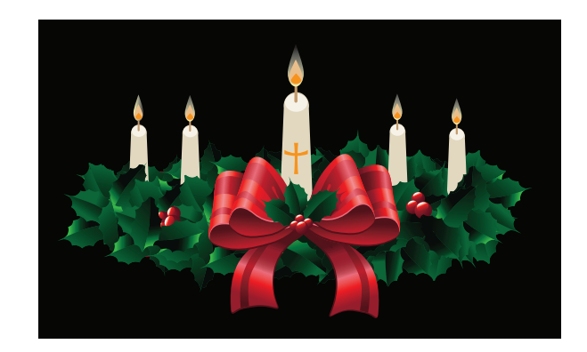
Shew me thy ways, O LORD; teach me thy paths. (Psalms 25:4)